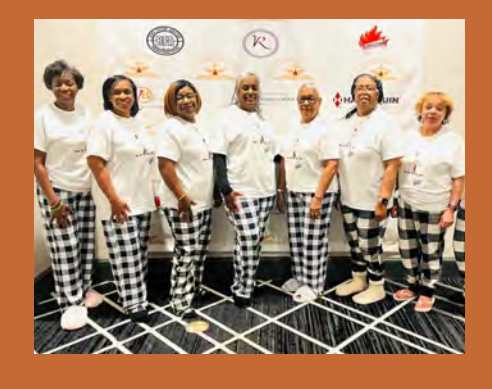
Book Signing at CBLR